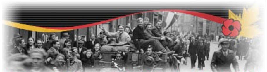
Victory in Europe (VE - Day) - May 8, 1945